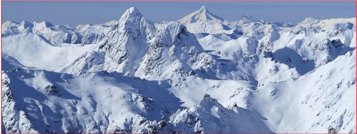
Cerro Alta Catedral, Bariloche, Argentina