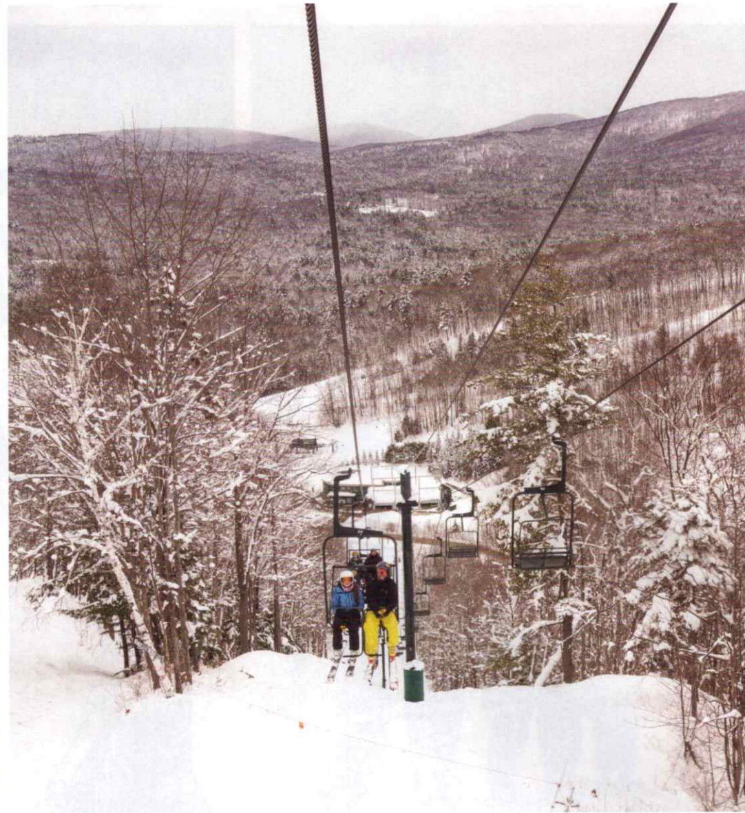
LEFT A group of independent young skiers approaches the Winslow quad chair from Pass Fail Trail.